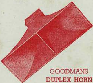
GOODMANS DUPLEX HORN P.A. LOUDSPEAKER

Size 36" x 18" Power handling capacity 20 Watts A.C. Peak. Speech coil impedance 15 ohms £15-0-0 Finish Brown Enamel (Subject)